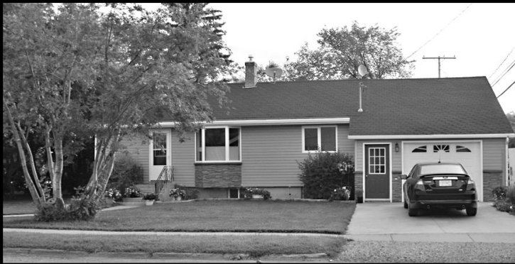
100 Bemister Ave East

Highway #6 Road Construction south of the CN Tracks has now begun.